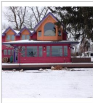
Kenton. This is closest to Kentucky Point.