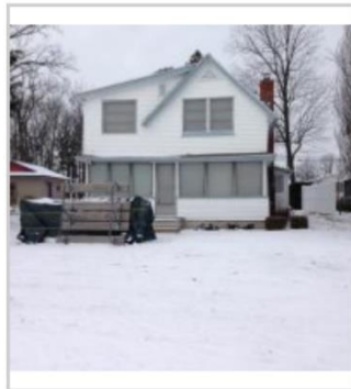
Campbell. Of the 3 cottages, only this one remains unwinterized.